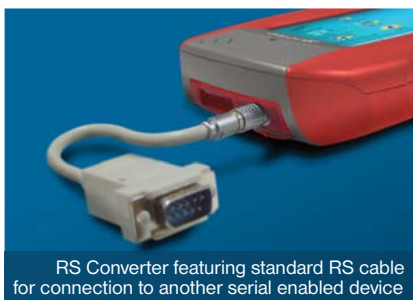
RS Converter featuring standard RS cable for connection to another serial enabled device