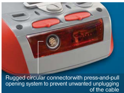
Rugged circular connector with press-and-pull opening system to prevent unwanted unplugging of the cable

Compatible with all Gotive H41 Series DS, SDS, MDS, TC and Accessories. For more details refer to the respective Gotive Datasheets * required Gotive accessory to enable direct serial communication to/from Gotive H41 RS