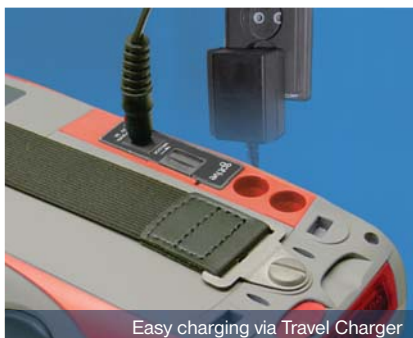
Easy charging via Travel Charger